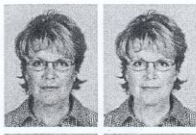
1) correct 2) correct

This page describes the requirements for the dimensions and other general characteristics of the standard passport photo.